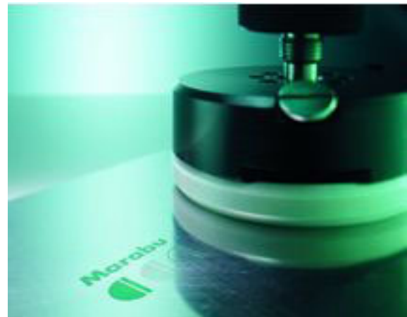
CUP WITH CERAMIC RING

Photopolymer plates are best used with cups that have ceramic rings. These rings are very flat and run well on the photopolymer material. Different photopolymer materials will perform better or worse and you will need to experiment. Broadly the harder materials are better not just from a wear point of view but also as regards to print quality.