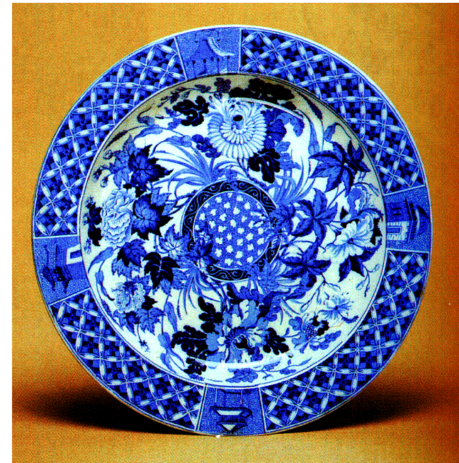
FIGURE 1.1 PLATE EXAMPLE

Before this time the Pottery Industry in Stoke on Trent had been using the same process for decorating their ceramic ware. It was generally single colour work on both flatware (plates, saucers, etc) and hollowware (cups, jugs, etc). The process was faster than applying transfers was but limited to one colour. Originally the transfer pads used by the potteries were made from an inflated pig's bladder. This was then replaced by gelatine. These pads were much bigger than those used in general industry, as they had to cover the area of a dinner plate.